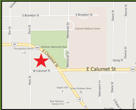
May 1, 9 AM-11 AM Calumet County Highway Shop 241 E. Chestnut St, Chilton